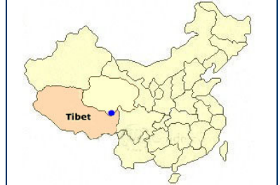
Fig.1 Map overview China and mainland Tibet