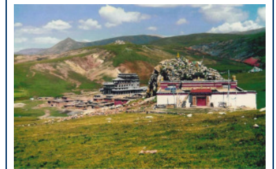
Fig.3 The Pal Demo Tashi Choling Monastery